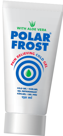
EFFECTIVE NATURAL PAIN RELIEF